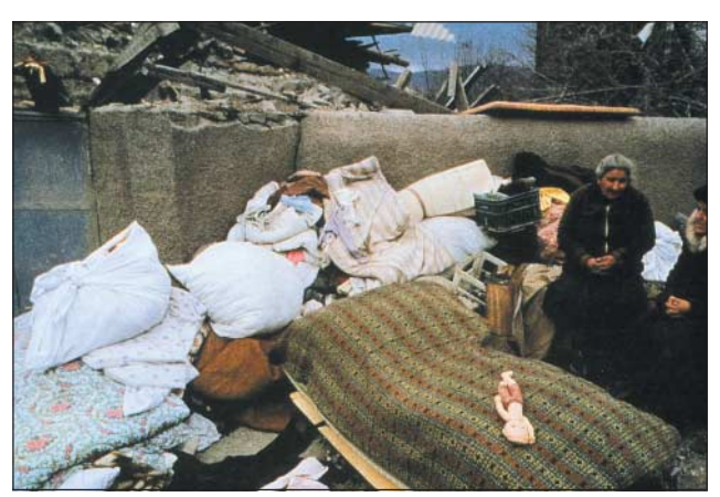
Homeless survivors of earthquake

The type of incident will determine the scale and type of consequences. For example, earthquakes and landslides cause crush injuries, and volcanoes cause breathing problems. All large scale incidents, but particularly conflicts, create the mass movement of people. The geography, climate, and weather will determine physical access to the disaster area. Political instability will influence the feasibility of the humanitarian response.