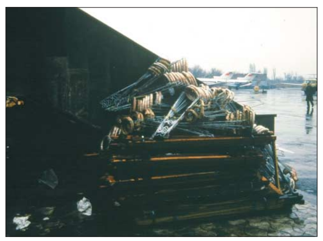
Unrequested and inappropriate aid left abandoned at a local airfield