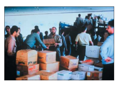
Material aid should be targeted on identified needs

*Mortality per 10 000 population per day